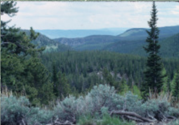
Maramie Basin, Wyoming.